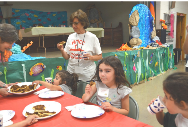
↑VBS began with a light supper providing an opportunity for volunteers to interact with and get to know the children. Homemade lahmajun was popular!